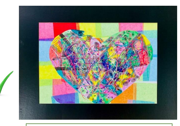
Artwork includes a 6cm frame. A 'store bought' frame may also be used