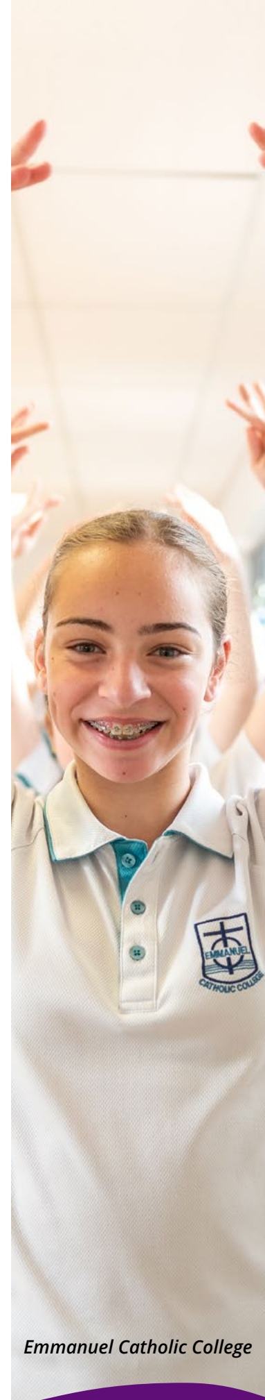
Emmanuel Catholic College