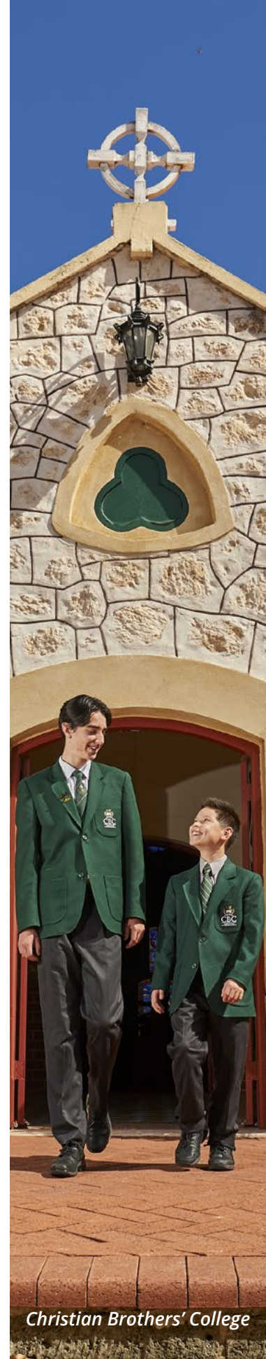
Christian Brothers' College

CHRISTIAN BROTHERS' COLLEGE (Fremantle) Jazz Big Band performance