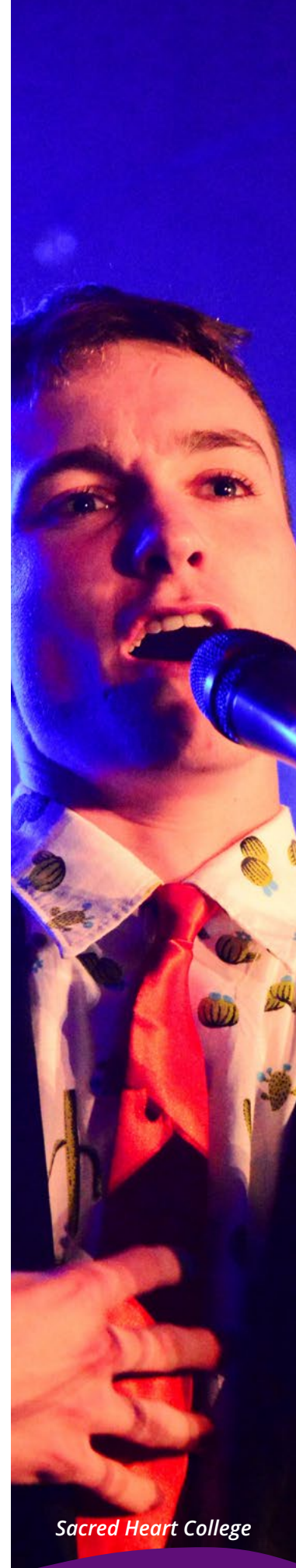
Sacred Heart College

MEL MARIA CATHOLIC PRIMARY SCHOOL (Attadale) Choir